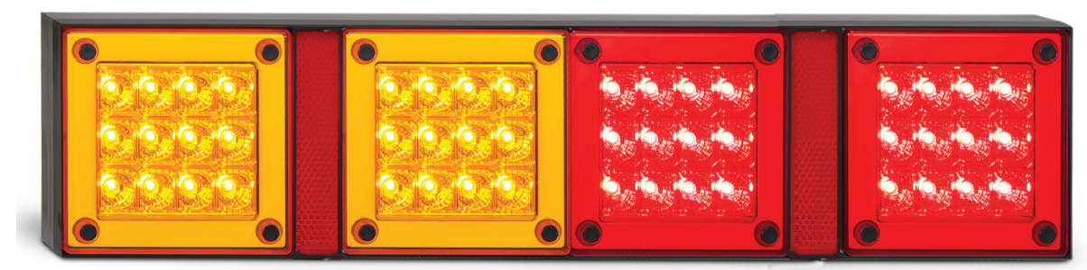
Stop/Tail/Indicator/Reflectors 420ARRM - Blister, 12-24 Volt