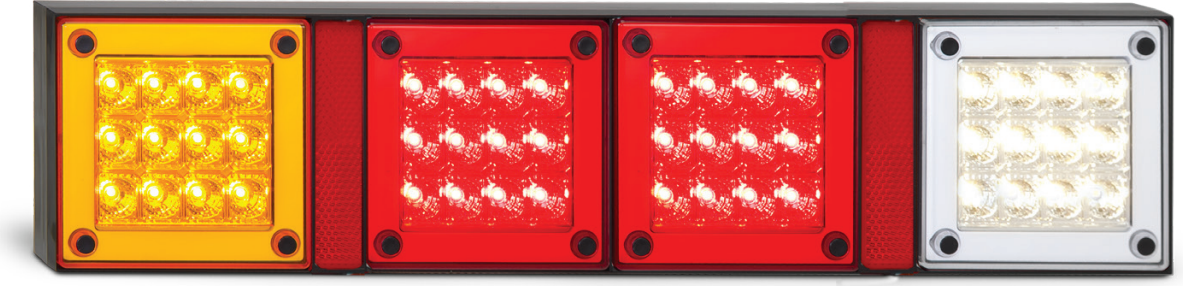
Stop/Tail/Indicator/Reverse/Reflectors 420ARWM - Blister, 12-24 Volt